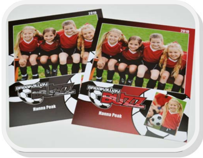
MEMORY MATE - 8" x 10" - $15