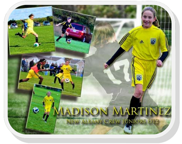
COLLAGE - $40 - $125