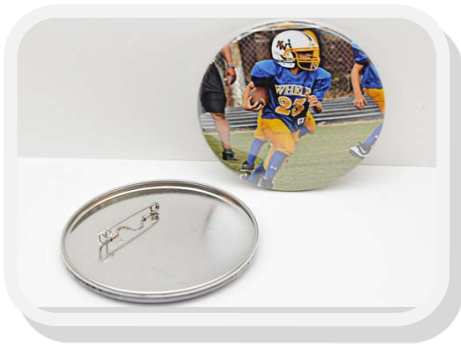
3" BUTTON - $5