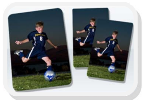
MAGNETS - 2 - $15