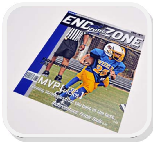
MAGAZINE COVER 8" x 10" - $15