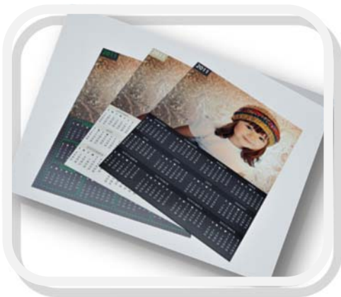
CALENDAR - $10