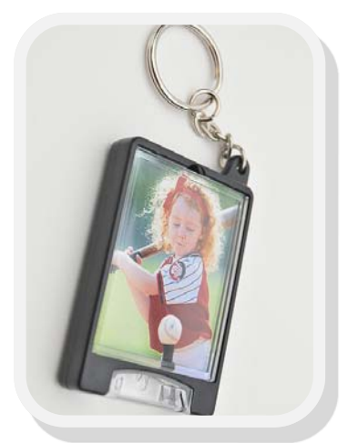
KEY CHAIN - $5