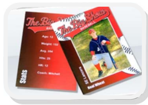
TRADER CARDS - 12 - $20