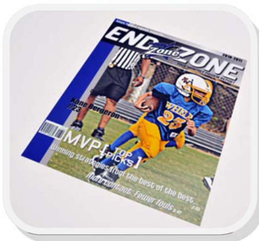
MAGAZINE COVER 8" x 10" - $15