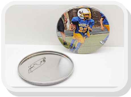
3" BUTTON - $5