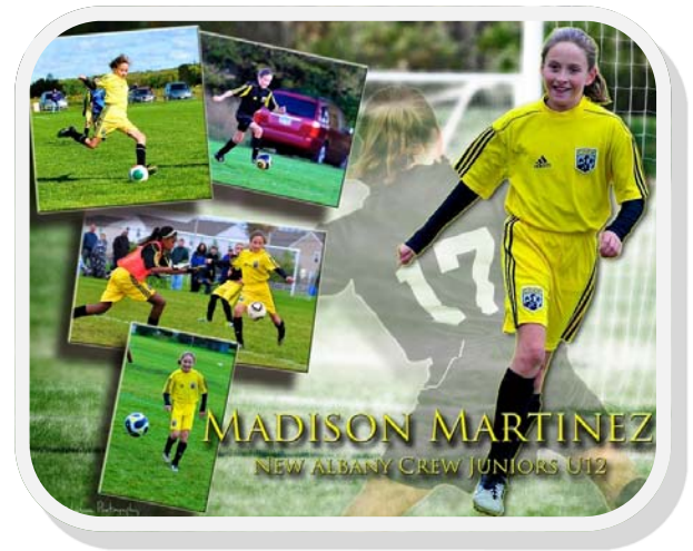
COLLAGE - $40 - $125