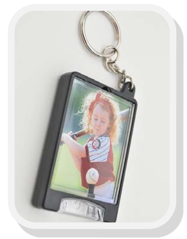
KEY CHAIN - $5